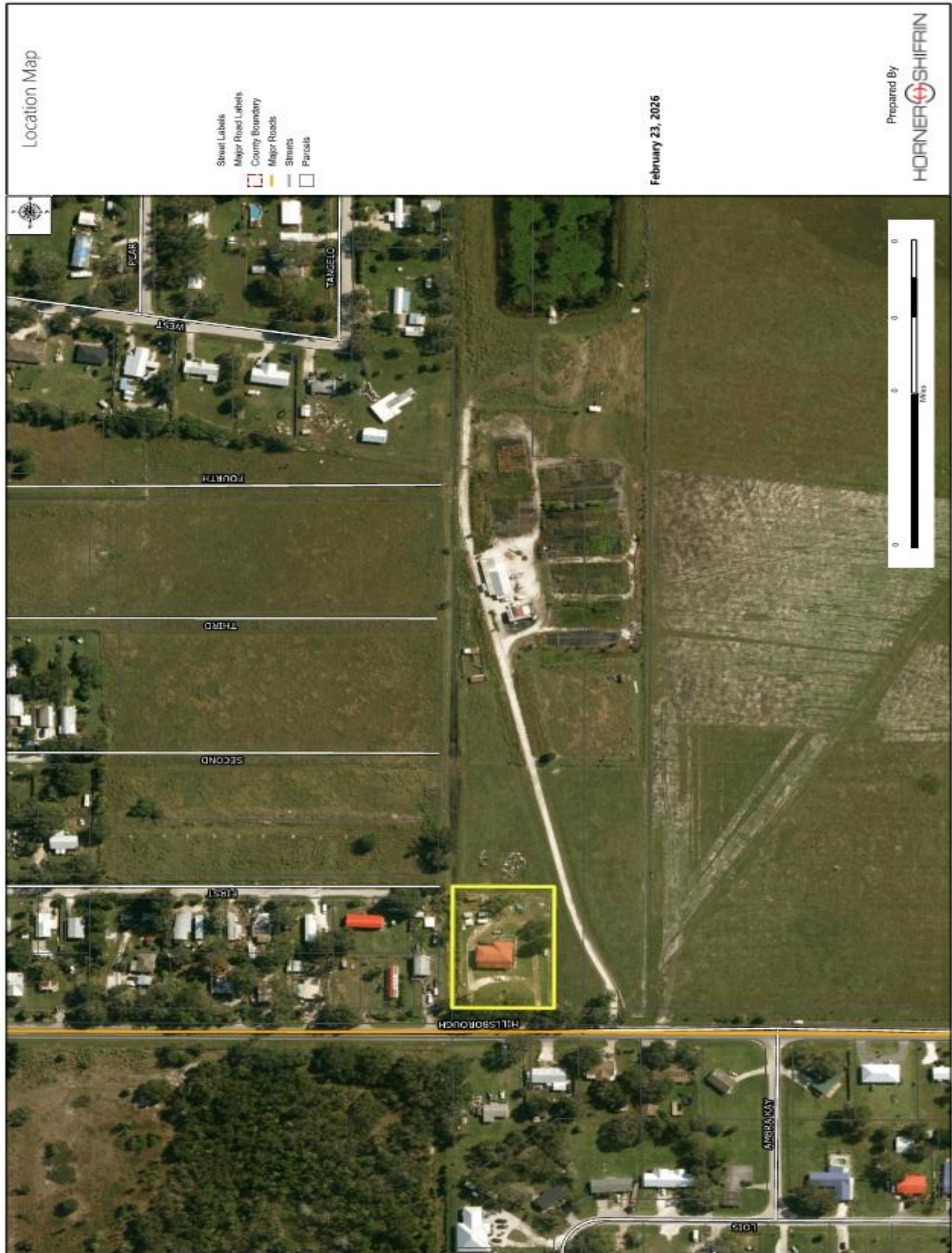
Exhibit A: Location Map