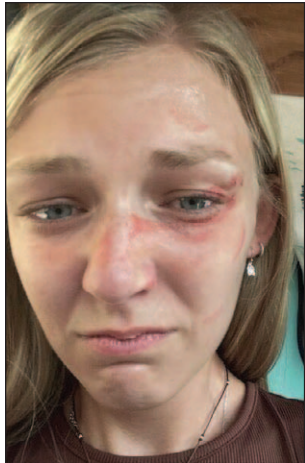
The law firm of Parker & McConkie, based in Utah, released a selfie taken by Gabby Petito after being attacked by Brian Laundrie.