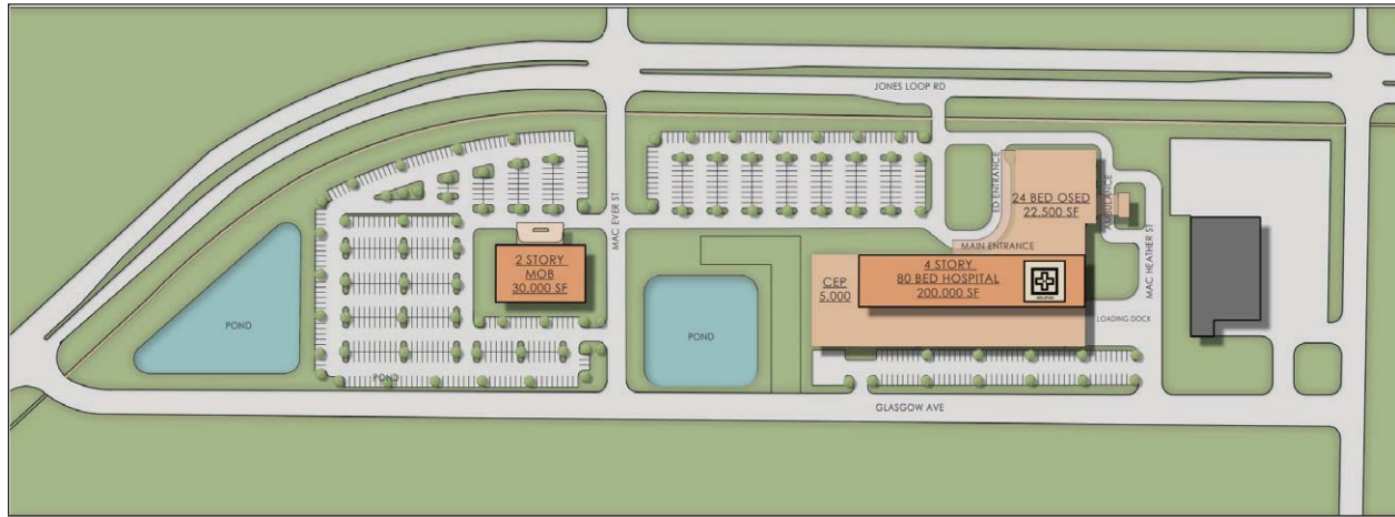
CITY OF PUNTA GORDA

"It's an expression of thanks, an acknowledgment that so much of what I hold most dear I owe to the people of this city and the people of the surrounding neighborhoods," Obama said.